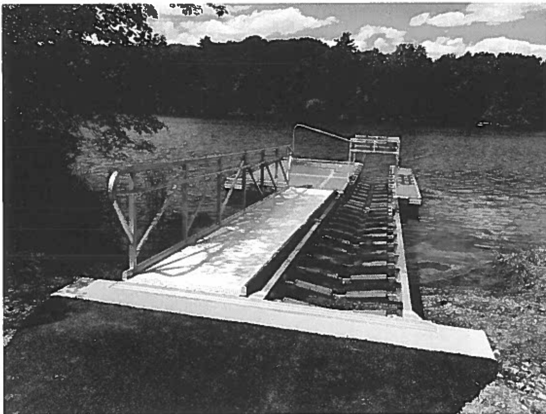
BoardSafe Adaptive Kayak Launch (base system shown with no accessories)